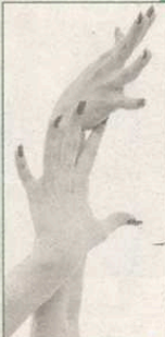
■ Lovely Lolita ... for best hair and nails treatments

A range of beauty treatments are available. The salon operates daily from 9.30am to 8.30pm. Contact 17540101 or e-mail lolitabahrain@gmail.com for more information.